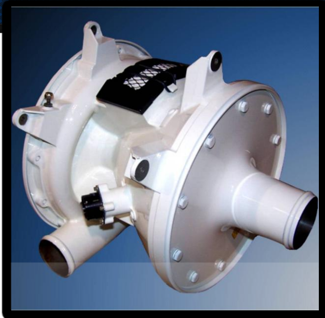
606802-2 Waste Vacuum Blower