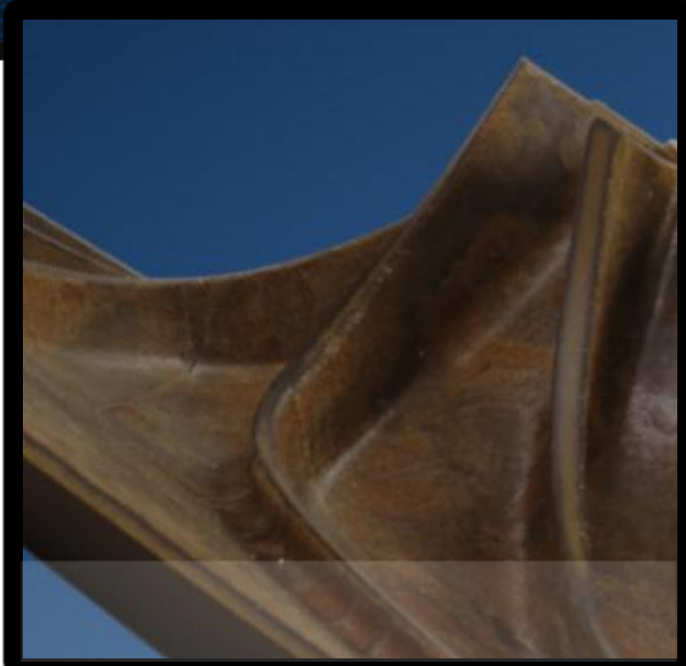
ADP38009-2 Impeller, 1 st Stage

PARTS AVAILABILITY - ADpma maintains stock on all of its advertised parts. To control costs and to provide preferred options to buyers, ADpma sells direct through StockMarket.Aero and ILSmart.com with accurate, real time stock listings and quotes.